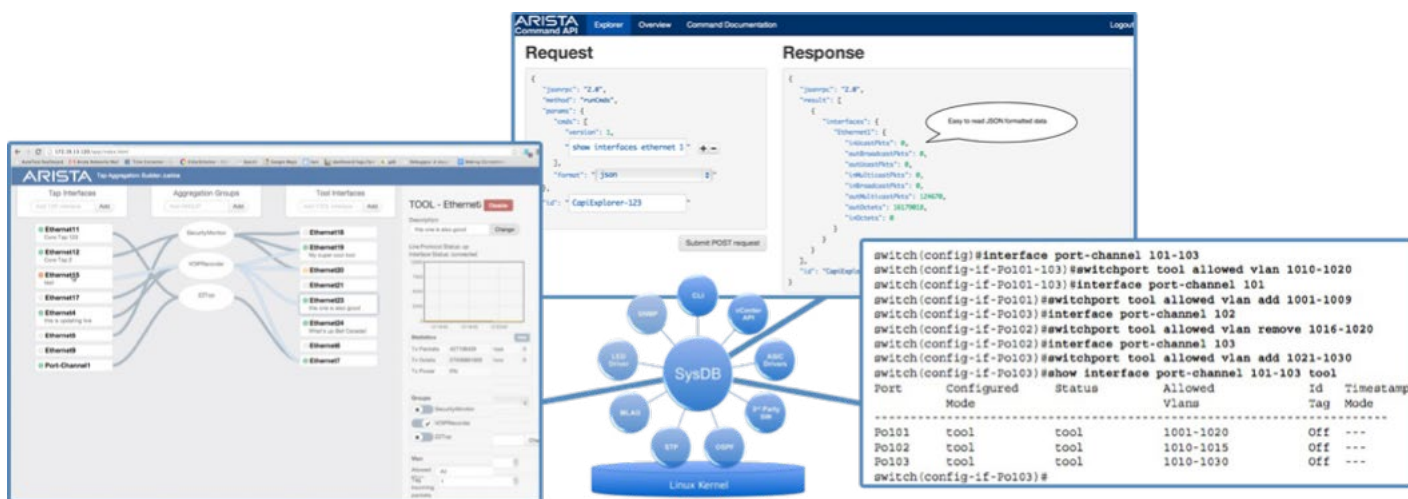
Figure 2: TAP Aggregation Management GUI, Industry-standard CLI, and Linux-JSON API