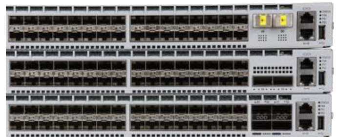
Arista 7280E Flexible Port Combinations