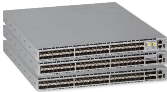
Arista 7280E family

All models in the 7280E Series deliver rich layer 2 and layer 3 features with wire speed performance up to 1.44 Terabits per second. The Arista 7280E Series offer a virtual output queue architecture combined with an ultra-deep 9GB of packet buffers that eliminates head of line blocking and allows for lossless forwarding under sustained congestion and the most demanding application loads. Combined with Arista EOS the 7280E Series delivers advanced features for HPC, big data, content delivery, cloud and virtualized environments.