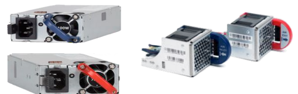
Hot swap and reversible power supply and fan modules