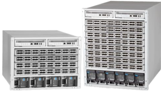
Arista 7320X Series