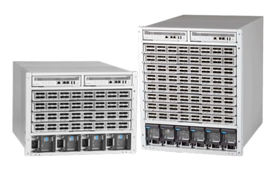
Arista 7320X Series