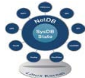
Figure 4: Arista FlexRoute™ Engine and EOS NetDB