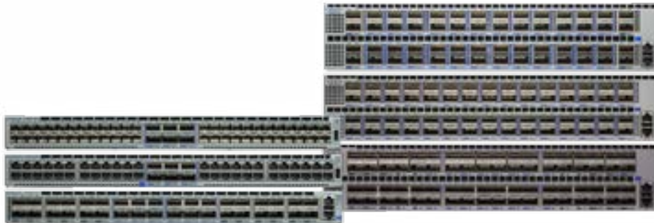
Figure 3: 7280R Series Platforms

The 7280R Series provide industry leading power efficiency with airflow choices for back to front, or front to back.