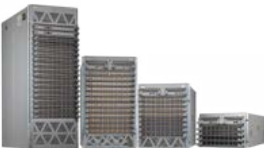
Figure 2: Arista 7500R Universal Spine platforms

The Arista 7500 Series uses a deep buffer virtual output queue (VOQ) architecture that eliminates head-of-line (HOL) blocking and virtually eliminates packet drops even in the most congested network scenarios. An advanced traffic scheduler fairly allocates bandwidth between all virtual output queues while accurately following queue disciplines including weighted fair queuing, fixed priority, or hybrid schemes. As a result, the Arista 7500 can handle the most demanding traffic requirements with ease, including mixed loads of real-time, multicast, and storage traffic while still delivering low latency.