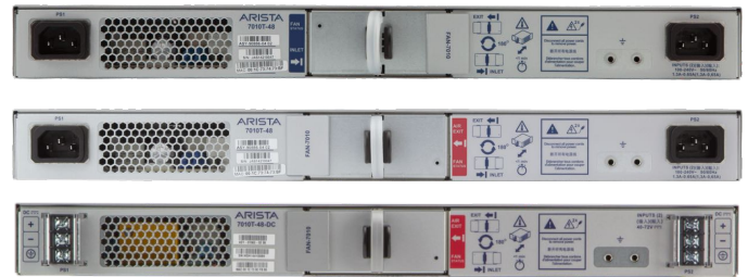
Arista 7010T Rear View - reversible airflow, AC & DC