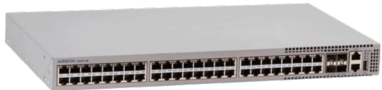
Arista 7010T-48: 48 port 10/100/1000 and 4 port 10GbE Switch

Consuming under 52W the 7010T are extremely power efficient at less than 1W per port. Built in power redundancy and customer reversible redundant fans allows cooling airflow in either forward or reverse direction in a single system.