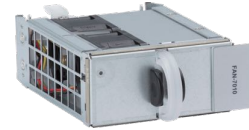
Arista 7010T hot swap and reversible fan module