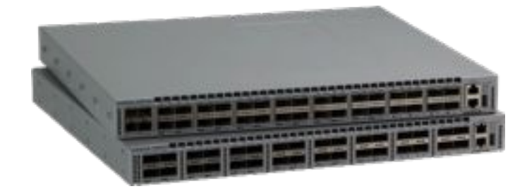
Arista 7050QX-32: 32 x 40GbE QSFP+ ports Arista 7050QX-32S: 32 x 40GbE QSFP+ ports, 4 SFP+ ports

Combined with Arista EOS the 7050QX Series delivers advanced features for big data, cloud, virtualized and traditional designs.