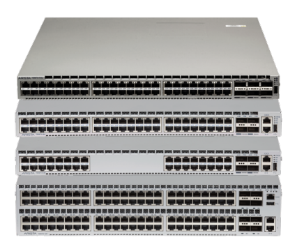
Arista 7050TX Series of 1/10GbE and 10/40GbE Switches Top to bottom: 7050TX-72Q, 7050TX-64, 7050TX-48, 7050TX2-128

All models in the 7050TX Series delivers rich layer 2 and layer 3 features with wire speed performance up to a maximum performance of 2.56Tbps. The Arista 7050TX switches offer low latency and a shared packet buffer pool of up to 16MB that is allocated dynamically to ports that are congested. With typical power consumption of less than 5 watts per 10GbE port the 7050TX Series are power efficient. An optional built-in SSD supports advanced logging, data capture and other services directly on the switch. Combined with Arista EOS the 7050X Series delivers advanced features for big data, cloud, virtualized and traditional data center designs.