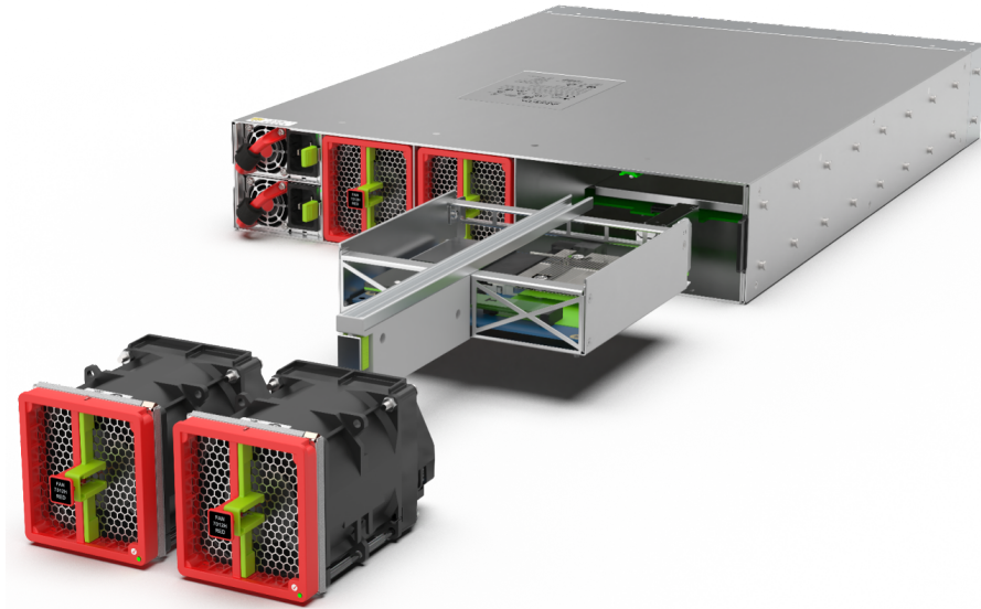
Arista 7060X6 Rear View: Accessing the field replaceable Supervisor card

The Arista 7060X6 series also uses a novel approach for the field replaceability of its components, in the 2RU variants. The Supervisor card can be field-replaced, accessing it by removing the two right-most fan units. This offers several benefits, particularly in terms of simplified maintenance, reduced downtime, increased flexibility, lower TCO, and improved reliability. This state-of-the-art design facilitates robust operational efficiency.