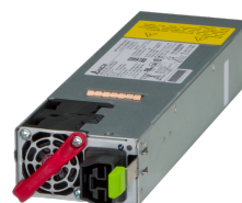
2.4kW Hot swap power supplies