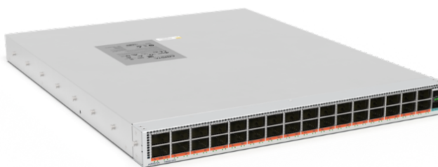
Arista 7060X6-32PE: 32 x 800 GbE OSFP ports, 2 SFP+ ports