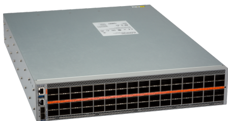
Arista 7060X6-64PE: 64 x 800G OSFP ports, 2 SFP+ ports

The 7060X6-32PE delivers 32 800G ports in a 1RU system with an overall throughput of 25.6 Tbps. The system also has 2 dedicated SFP+ data plane ports. The 7060X6-32PE offers OSFP interfaces, supporting industry standard optics and cables allowing for ease of migration to 800G. All ports allow a choice of speeds including 800 GbE, 400 GbE, 200 GbE or 100 GbE, up to 256 interfaces.