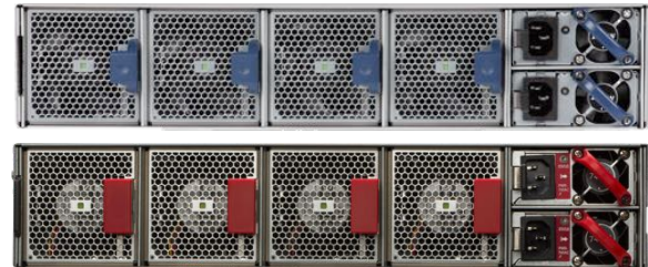
7170 2RU Rear View: Rear to Front and Front to Rear