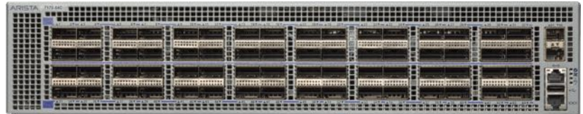
Arista 7170-64C: 64 x 40/100GbE QSFP100 ports, 2 SFP+ ports

The Arista 7170-32C with 32 QSFP100 ports is based on the same architecture as 7170-64C providing the full throughput and performance in a dense 1RU chassis supporting up to 32x 40/100GbE, 64x 50GbE or 128x 10/25GbE interfaces