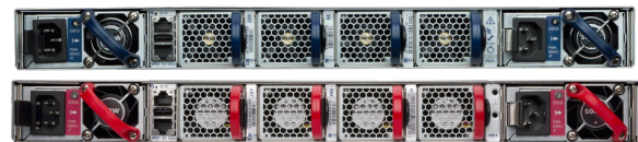
7170 1RU Rear View: Rear to Front and Front to Rear