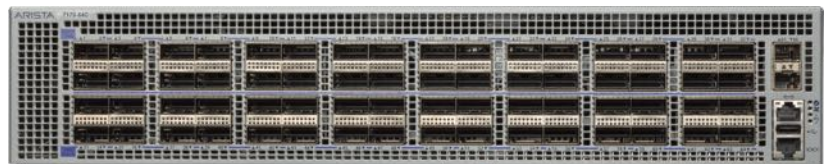
Arista 7170-64C: 64 x 40/100GbE QSFP100 ports, 2 SFP+ ports

The Arista 7170-32C with 32 QSFP100 ports is based on the same architecture as 7170-64C providing the full throughput and performance in a dense 1RU chassis supporting up to 32x 40/100GbE, 64x 50GbE or 128x 10/25GbE interfaces. The 7170-32CD delivers the same port configuration as the 7170-32C with dual pipelines, connecting the 32 ports with the same capabilities as the 7170-64C