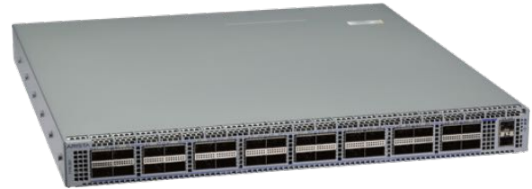
Arista 7170-32C: and 7170-32CD 32x 100GbE QSFP100 ports, 2 SFP+ ports