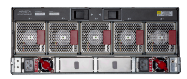
Arista 7368X4 Series Rear

DCS-7368-16S SFP28 - 16 ports of 25G with support for 25G and 10G on