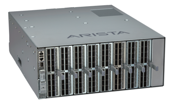
Arista 7368X4 Series