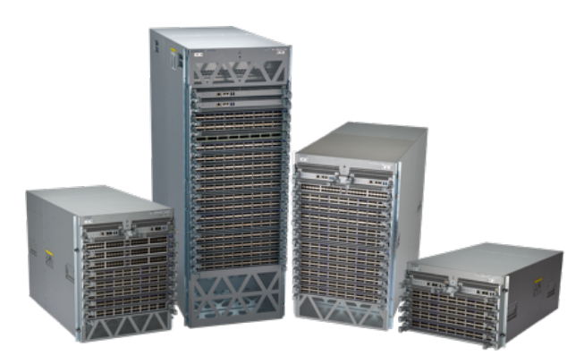
Arista 7500R Series Modular Data Center