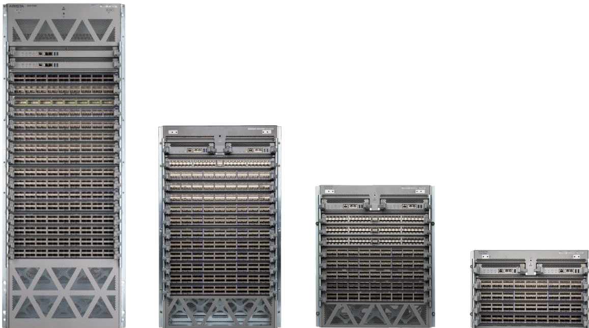
Arista 7500R Series Chassis (left to right) - 7516R, 7512R, 7508R and 7504R

The 7500R Series chassis each provide room for two supervisor modules, four, eight, twelve or sixteen line card modules, grid redundant power supply modules, and six fabric modules. Supervisor and line card modules plug in from the front, while the fabric modules and power supplies are inserted from the rear. The system uses a completely passive midplane and provides control plane connectivity to each of the fabric and line card modules. The system design is optimized for data center deployments with front-to-rear airflow.