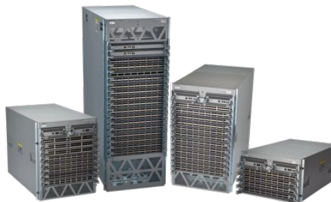
Arista 7500R Series Modular Data Center Switches

All components are hot swappable, with redundant supervisor, power, fabric and cooling modules with front-to-rear airflow. The system is purpose built for data centers and is energy efficient with typical power consumption of under 25 watts per 100GbE port for a fully configured chassis. These attributes make the Arista 7500R an ideal platform for building reliable and highly scalable data center networks.