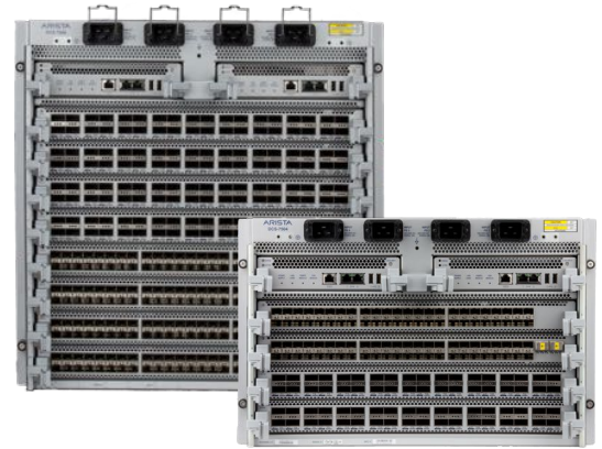
Arista 7500 Series Chassis

The 7500E series switches are equipped with four 2900W AC power supplies. The power supplies are 2+2 grid redundant and hot-swappable. The power supplies are gold climate saver rated and have an efficiency of over 90% with single stage conversion to the internal 12V DC voltage.