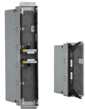
Arista 7500 Series Fabric Modules