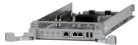
Arista 7500 Series Supervisor