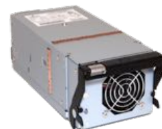
Arista 7500 Series Power Supply