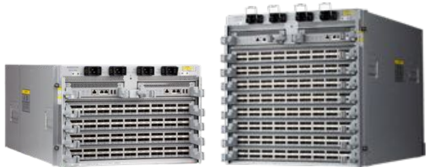
Arista 7500E Series Modular Data Center Switches

With front-to-rear airflow, redundant and hot swappable supervisor, power, fabric and cooling modules the system is purpose built for data centers. The 7500E Series is energy efficient with typical power consumption of under 4 watts per port for a fully loaded chassis. All of these attributes make the Arista 7500E an ideal platform for building reliable, low latency, resilient and highly scalable data center networks.