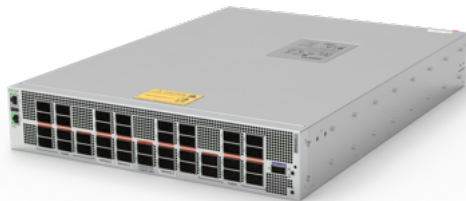
7700R4C-38PE: 38 port 800GbE Distributed Leaf Switch

Arista 7700R4 systems can be combined in various topologies to provide a choice of density, scale and speed, with linear CapEx and OpEx. 7700R4 Series systems are designed with maximum efficiency in mind, based on an advanced 5nm silicon geometry combined with optimized power and cooling design. Support for passive copper cables up to 4m and Linear-drive Pluggable Optics dramatically reduces the power and cooling footprint of very large scale networks.