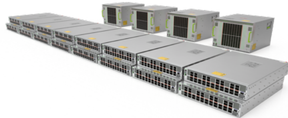
Arista 7700R Distributed Etherlink Switch

Arista Etherlink for AI adds layers of smart, workload specific functionality improving, traffic management, configuration consistency and visibility - critical factors in building, operating and troubleshooting very large clusters and minimizing downtime.