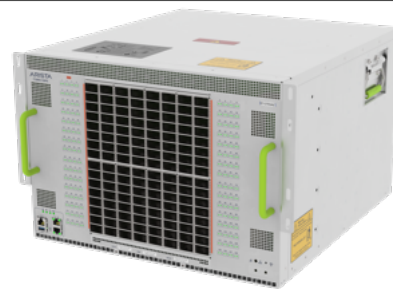
7700R4-128PE: 128 port 800GbE Distributed Spine Switch