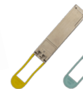
40GBASE-LRL4, UNIV, LR4 and XSR4 QSFP+