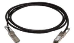
100GBASE-CR4 Copper Cable