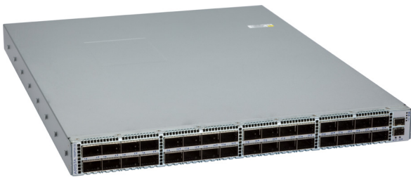
7060PX4-32 Switch with 32 x OSFP Ports