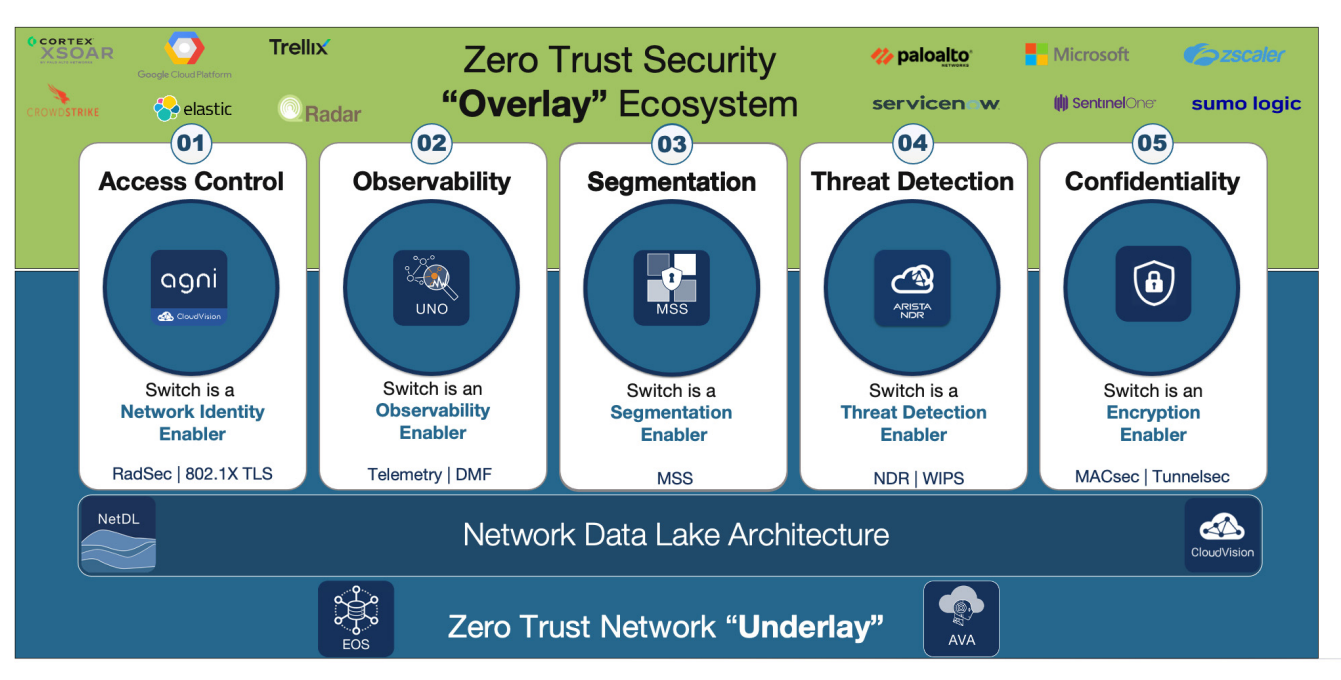
Figure 4: Arista Zero Trust Networking Solution

This foundation of core technologies in turn enables a suite of capabilities that integrate with each other to form Arista's zero trust networking solution (Figure 4).